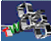
Award winning systems for fast moving businesses